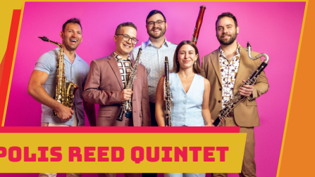
AKROPOLIS REED QUINTET